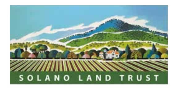
Land connects us all – protecting it today, saving it for tomorrow Solano Land Trust News–Immediate Release